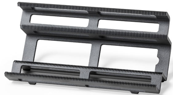
Contiguous Wafer Boat

OpX is a trademark of CoorsTek, Inc. CoorsTek is a registered trademark of CoorsTek, Inc.