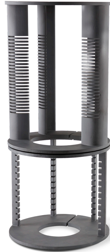
Vertical Column Wafer Boat & Pedestal

With over 50 manufacturing locations across four continents, CoorsTek is the international partner of choice for high-performance semiconductor components. For more information, contact a CoorsTek materials expert today at +1 800 821 6110.